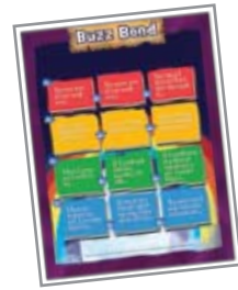
Buzz Bond Poster