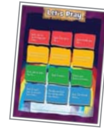
Let's Pray Poster