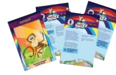
Bible Buzz Cards